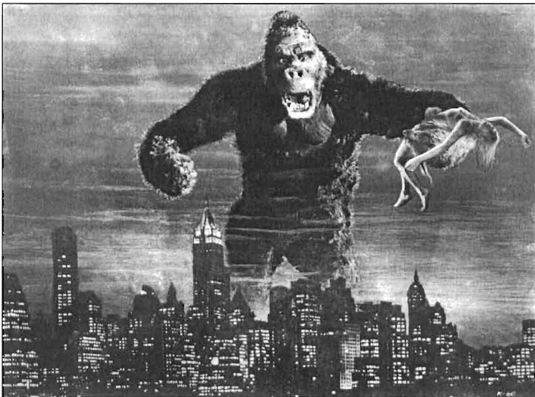
King Kong (RKO Radio Pictures 1933 (promotional poster)).

captivity, kidnapped a white woman, and went on a murderous rampage. The racialized imagery associated with King Kong has long been recognized. Indeed, the original German version of the movie, released in 1933 Nazi Germany, carried the title that translated to “King Kong and the White Woman.” See Thomas E. Wartenberg, Humanizing the Beast: King Kong and the Representation of Black Male Sexuality , in Classic Hollywood, Classic Whiteness , 157, 157–58 (Daniel Bernardi, ed. 2001). Further, the placing of a sign that read “King Kong lives” near an African American employee’s workstation and calling him “a monkey, a boon, an ape [and] a gorilla” were among the referenced conduct that supported a punitive damage award in a racially hostile workplace case. Turley v. ISG Lackawanna, Inc. , 960 F. Supp. 2d 425, 433–34 (W.D.N.Y. 2013).